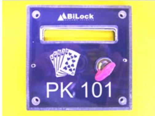
OPEN FOR PLAY